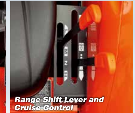
Range Shift Lever and Cruise Control