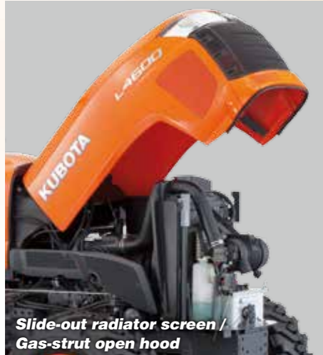
Slide-out radiator screen / Gas-strut open hood