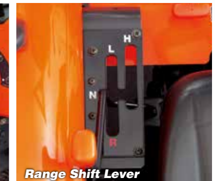
Range Shift Lever