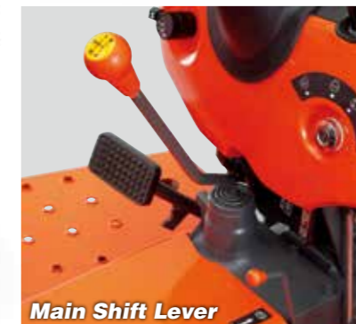
Main Shift Lever