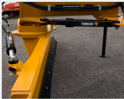
85% of total weight on cutting edge