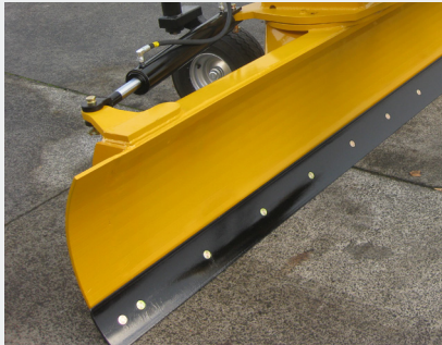
Massive depth to carry more soil