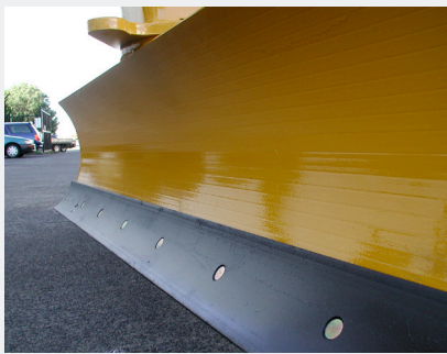
Manganese hardened steel cutting edge