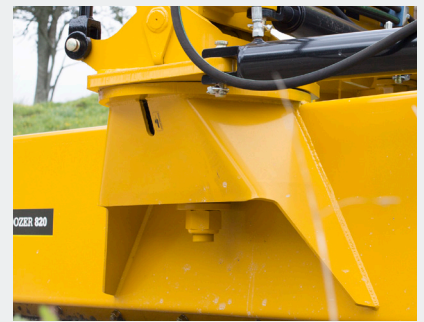
50mm nut on 100mm shaft.