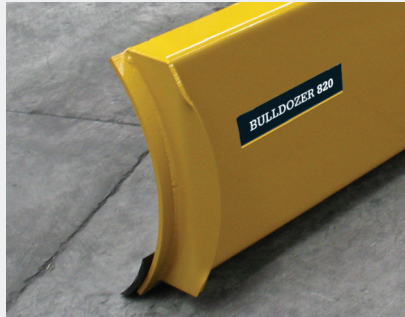
Double plated mould board