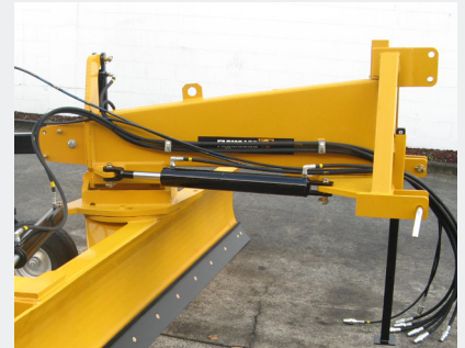
Tapered beam for extra strength