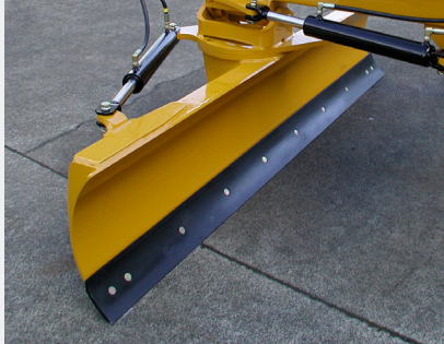
Massive depth to carry more soil