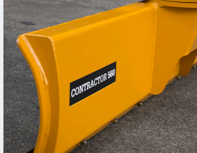
Double plated mould board